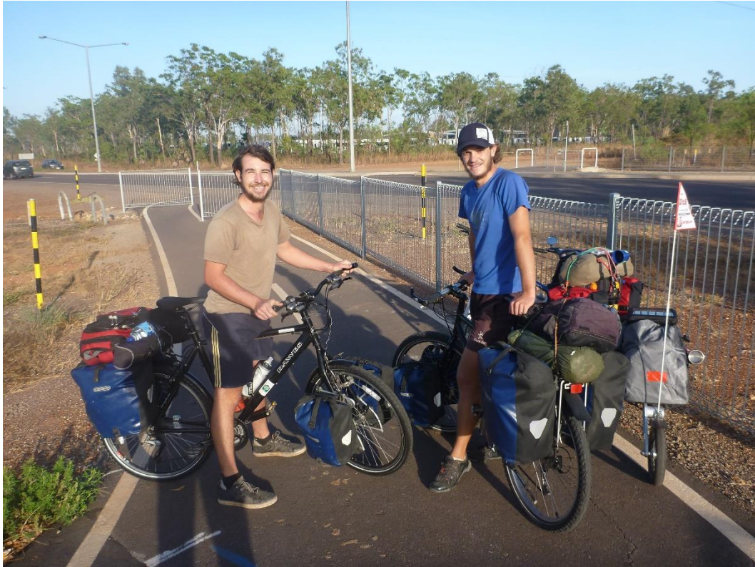
Day01-Two Lads off to Brisbane (Qld) from Darwin